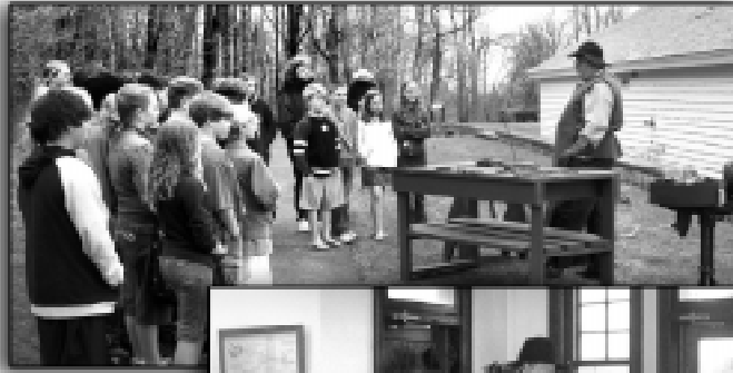
6th Graders at the Lemon House