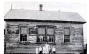
The Diehl School