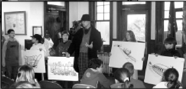
5th Graders at the museum