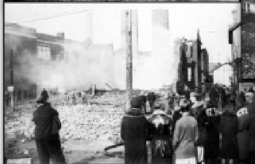
On December 29, 1931 a devastating fire burned the 1909 grade school building

hydrants and later low water pressure made it impossible to save the school. The firemen concentrated their efforts on saving the high school building located a few feet away and the gymnasium located behind the 1909 school. The firemen sprayed water on the high school building from the rooftop of the gymnasium and were able to save the high school building and the gymnasium with very limited damage.