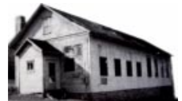
Benscreek Third Building